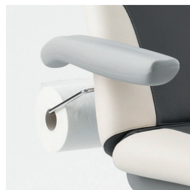
Paper roll holder