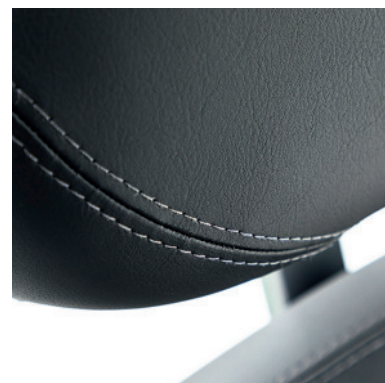
Various cover materials